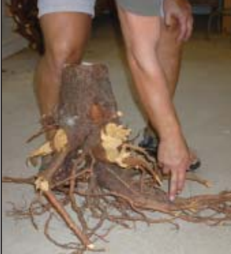
Figure 2. Root depth can be influenced by localized soil changes. (a) A layer of dense mineral material, likely an artifact of previous construction, ĥas confined roots of this black maple (Acer nigrum) very close to the surface. \triangleleft (b) These loblolly pine (Pinus taeda) roots encountered a shallow water table and abruptly changed direction.