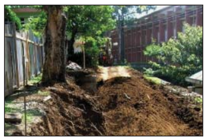
Figure 1. Root depth varies by site. At the construction site pictured here (University of Costa Rica; San José, Costa Rica), nearby trees root systems can be seen to penetrate several meters deep.

Tree roots seem to be able to grow everywhere. There are documented instances of roots penetrating cracks in rock 100 microns wide (that's one-tenth of a millimeter). They grow into sewers, buildings, basements, and even through large expanses of open air space. But somehow they rarely grow through compacted urban soils. There are exceptions though. For example, some tree species can elongate roots through compacted soil when it is softened by moisture. Also, some coarse-textured soils are less compactable than fine-textured clays, and roots may penetrate more deeply (Figure 1). Some considerations when estimating rooting depth: