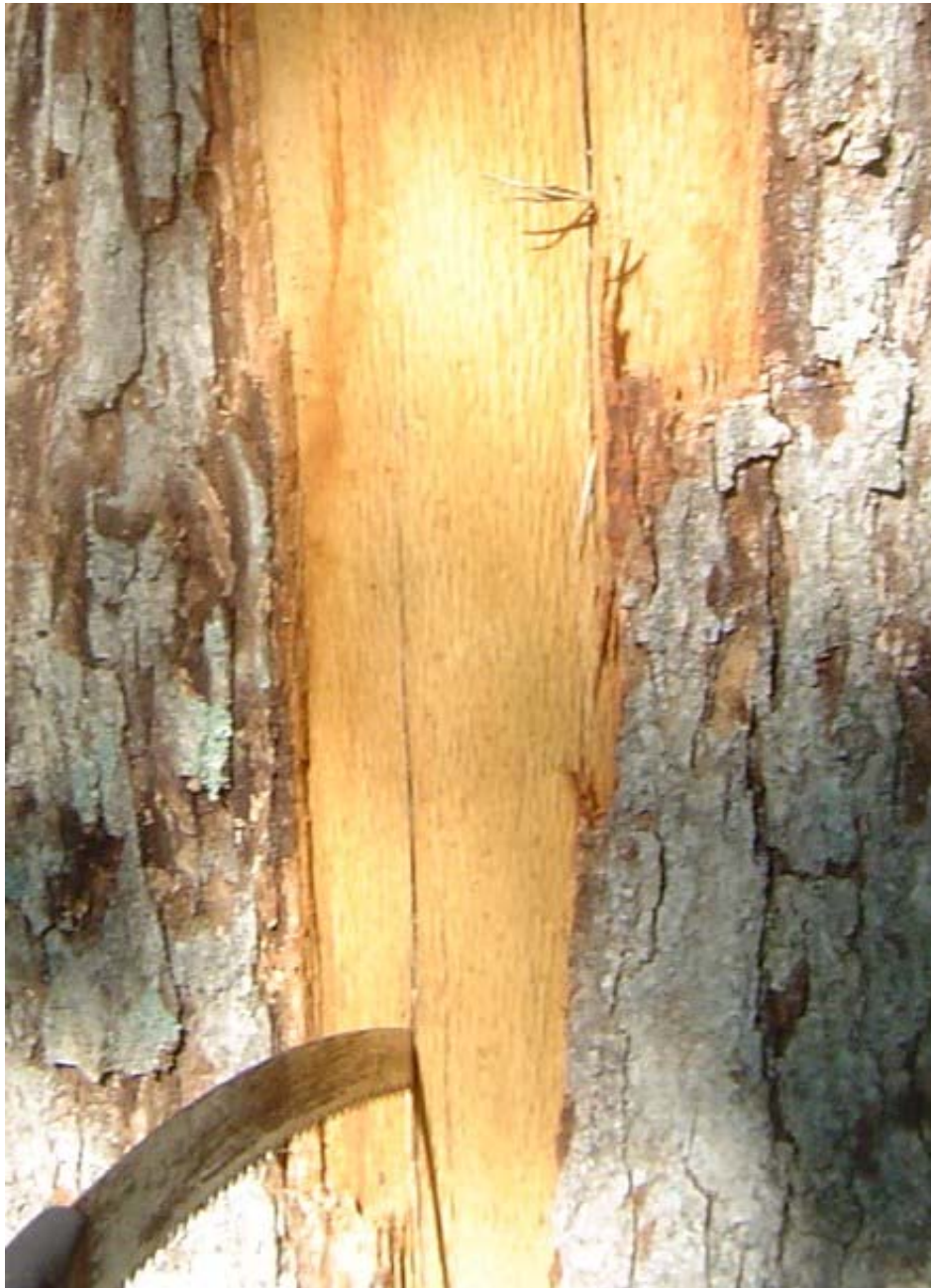
Deep cracks in white oak ( Quercus alba ). Location was at a major fork thirty feet above the ground. Damage was not visible from the ground. Bark loss was extensive. The tree had to be removed.

species can make it unstable, making it unable to safely sustain the loads of rigging during removal. Cracks can be assessed by probing with a handsaw, or a thinner instrument if needed. If the cracks are deep and many, consider removal.