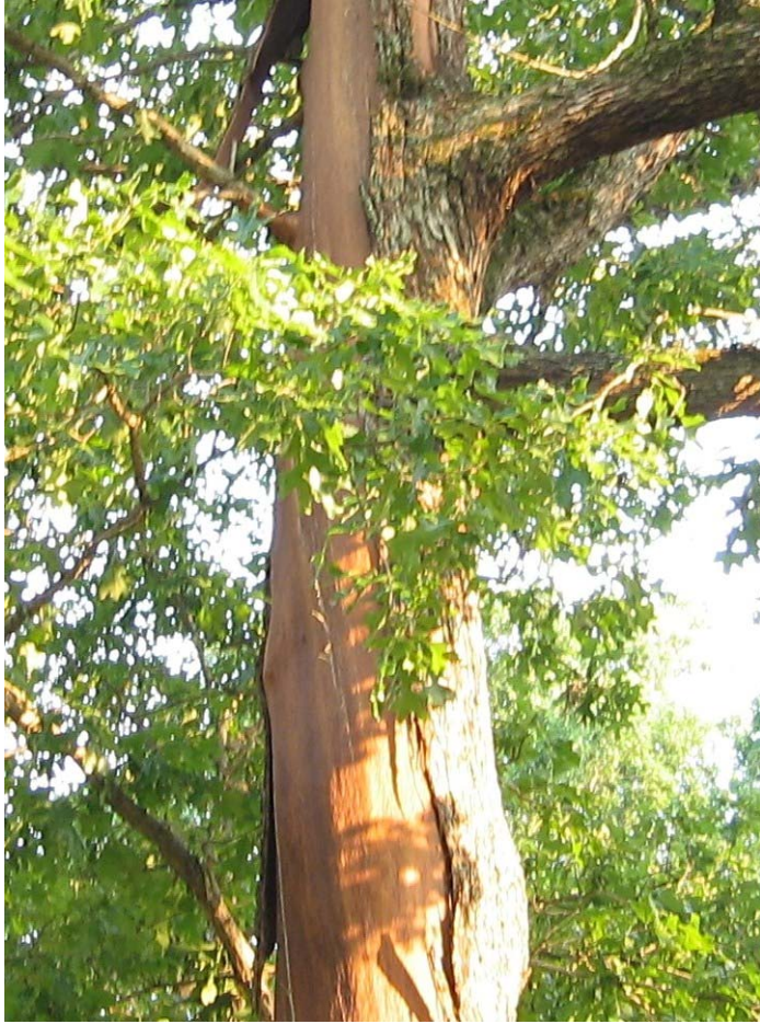
Extensive bark damage and cracking forced removal of tree.