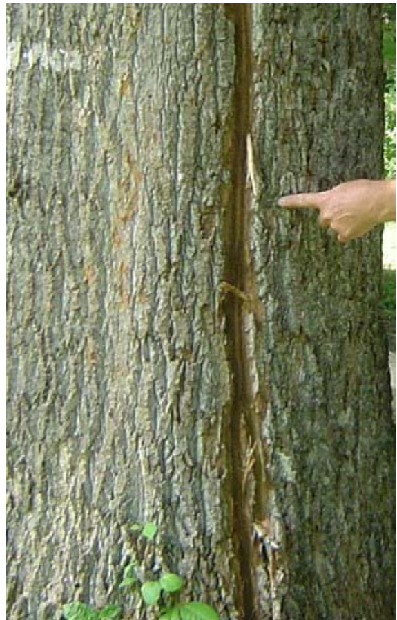
Lightning streak in Tulip tree ( Liriodendron tulipifera ). The raised area to the left of the streak—the bark is detached from the tree.